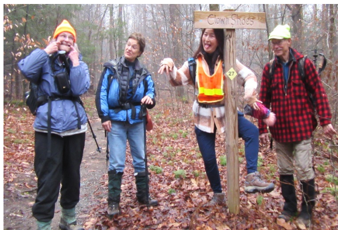
Clowning around on the Clown Shoes Trail.

We parked at the main parking lot for the Slate Valley Trails Fairgrounds trail system on Town Farm Road just off of Route 140 between Poultney and Middletown Springs. Certain trails on the Fairgrounds East set of trails were closed for hunting season, so we stayed far away from those and went onto the Fairgrounds West series of trails. Parts of that land